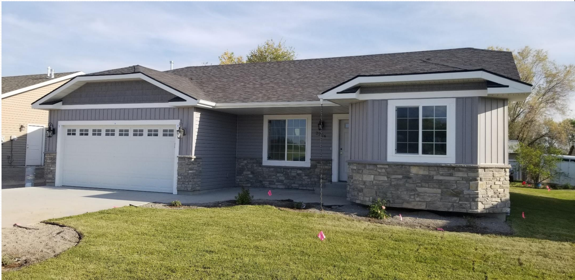
Diamond Plan~ 4-Bedroom/2 -Bath 1445 square feet