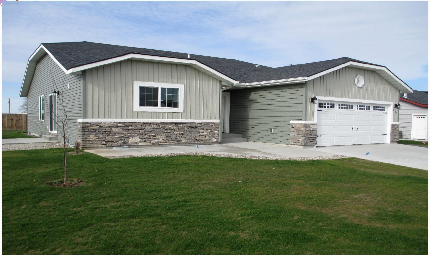
Onyx Plan~ 4-Bedroom/2 –Bath 1651 square feet